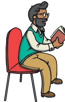
table snow door cloud plane friend book teacher banana chimney